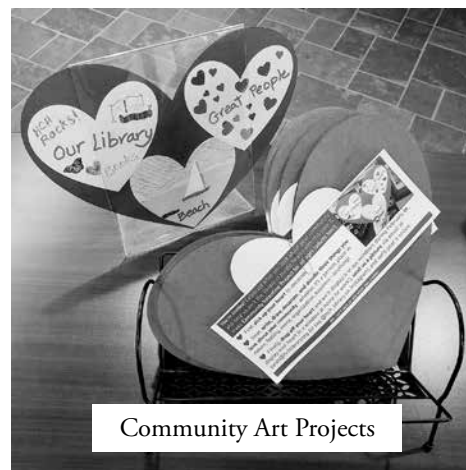
Community Art Projects

Virtual Book Chat - Monthly/4th Tues. @ 9:30 am: Log online for a chat with fellow bibliophiles about the latest faves and flops and some of the library's new arrivals. Participants will receive a monthly list of