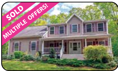
293 Boston Post Road, Old Lyme, Connecticut $429,000

The Time to List is Now Whether Buying or Selling Let Me Help You Make It Happen