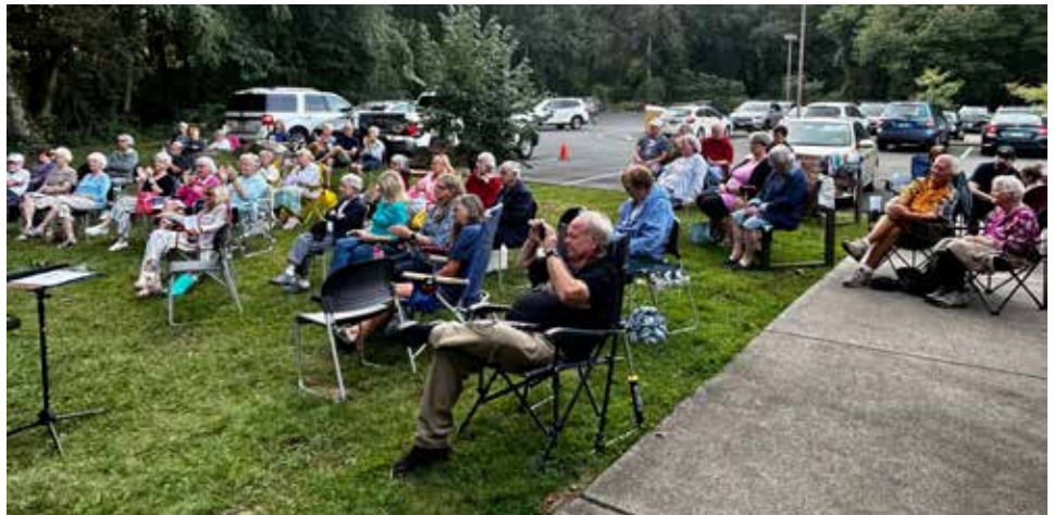
Last September marked our first ever town-wide senior concert!