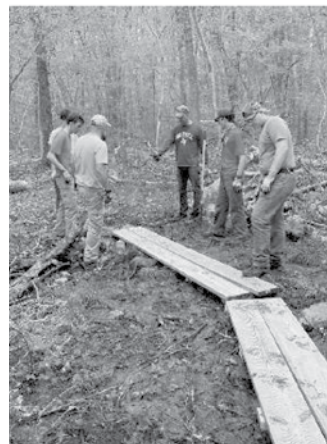
New plank construction