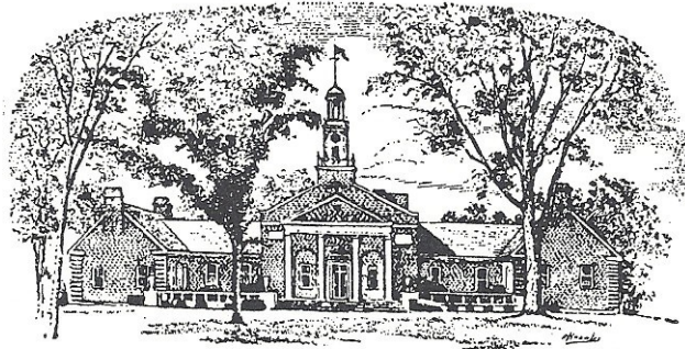
HOUSING AUTHORITY TOWN OF CLINTON, CONNECTICUT 06413