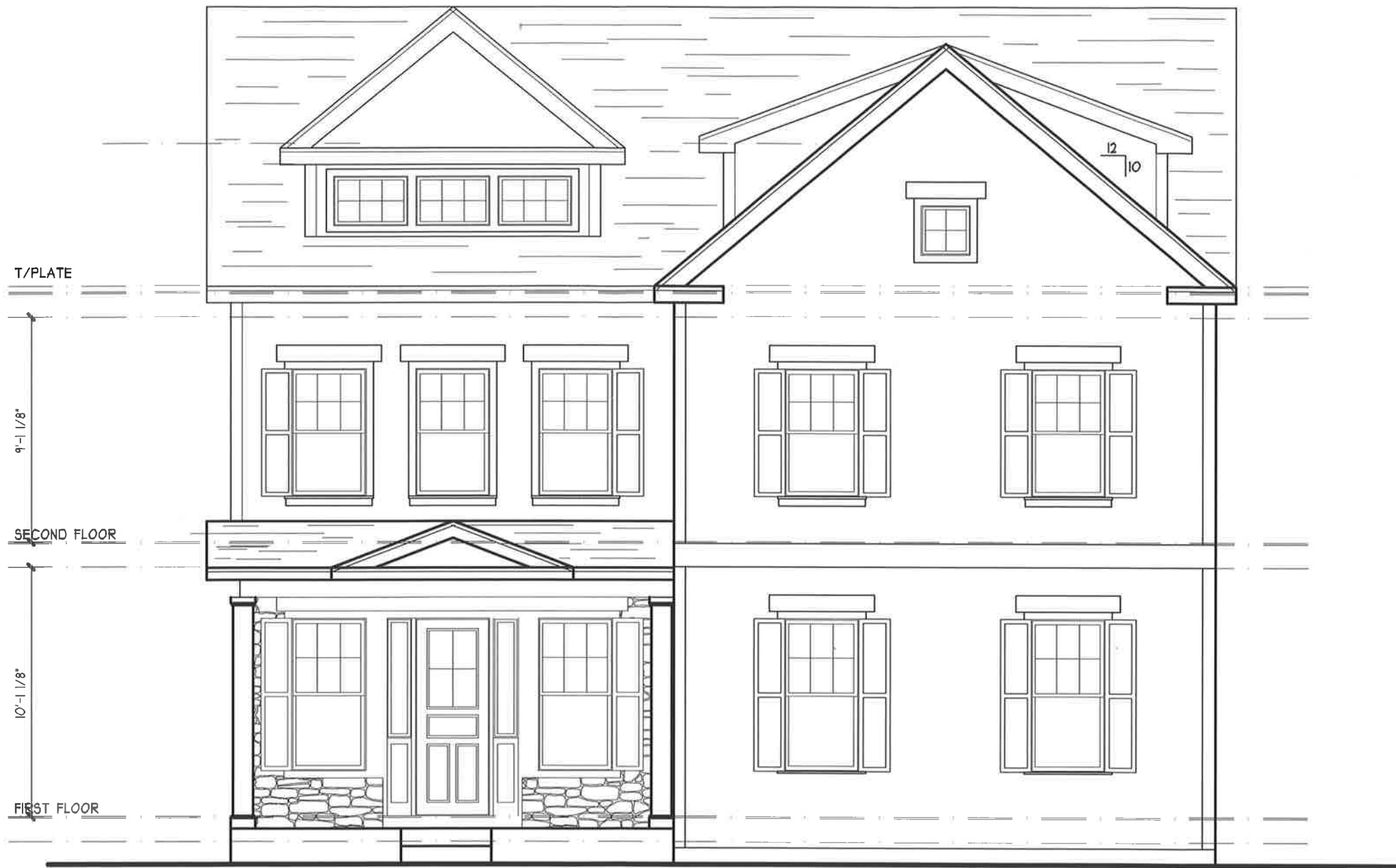
FRONT ELEVATION SCALE: 3/16"=1'-0"

MERRELL ARCHITECTS 909 WEST MAIN STREET SUITE 3-H WATERBURY, CT 06706 P. 203.753.6676 F. 203.755.2826 merrellarchitects.com